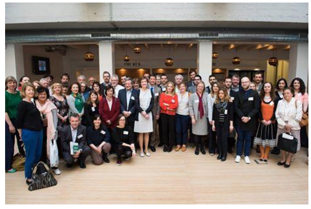
Delegates at the General Assembly

After normal subjects handled on this type of assembly there was a question time with Pierre Moscovici, Commissioner for Economic and Financial Affairs, Taxation and Customs.