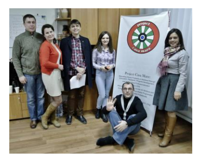
Project Casa Mare team

Moldova and the National Association of Social Workers in Moldova. This trilateral partnership operates under the mission of promoting social work professionalization, education, and legitimization in Moldova and other post-socialist countries - according to the international standards and in cooperation with international The scope of social work organization. interlocking activities of Project Casa Mare includes development of social work university curriculum and cutting edge educational methodologies, pursuing social entrepreneurship projects in Moldova, organizing international social work conferences, capacity building of social work cadre in Moldova, and activities designed to promote civil society in Moldova and beyond. Project Casa Mare emphasizes dialectic social work, systemic approach to social problems, youth participation, international social work solidarity, community organizing, and social entrepreneurship.